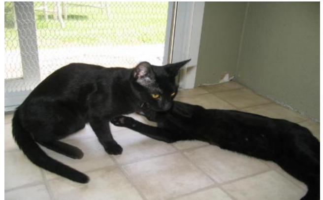
Mikie and Louie are living like princes in their wonderful new home...and they're together forever.