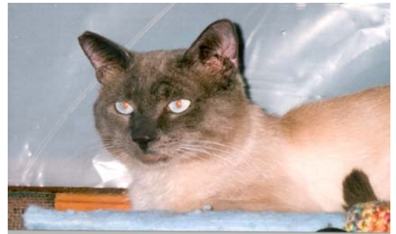
I can't wait to come home with you!

Kitaro is a two-and-a-half year old Siamese chocolate point beauty. He was found hiding underneath an apartment complex in the Valley and had clearly been abandoned by his former owner. He is such an angel. Kitaro is sweet and gentle and he would love to have a forever home with you!