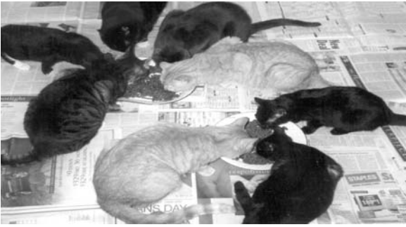
We will always protect them.

FALA will never falter in our commitment to the feral cats of Los Angeles . We maintain several feral cat colonies . All the animals in each colony are spayed and neutered so the cycle of homeless animals giving birth to more homeless animals can be stopped. The feral cats are fed and cared for, thanks to FALA volunteers.