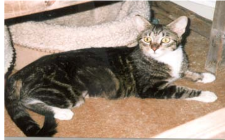
I've got lots of love to give!

Meadow and her four kittens were found underneath an apartment complex in the Valley. She is a classic mackerel Tabby, and she is a total sweetheart. Meadow would love to come sit on your lap and cuddle with you!