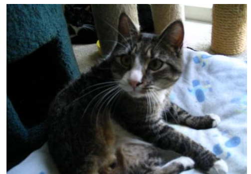
Lionel: Hi! Wanna snuggle?

Luke has been with us since January of 2006. He is being fostered by the wonderful mom who adopted Mike and Louie. Lionel has also been with us for over two years. We will make sure they are safe and happy until they find their own new home.