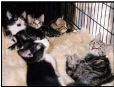
We're little cats with huge hearts!

Three of Meadow's kittens are still available for adoption (we're happy to report that Mack has a forever home!) Precious Karl , Chloe , and Julie hope to find their forever home too. We also have beautiful baby Magpie available for adoption. This little girl was found hiding in a tree, terrified and hungry. But now she's safe and she's blossomed into a true love bug!